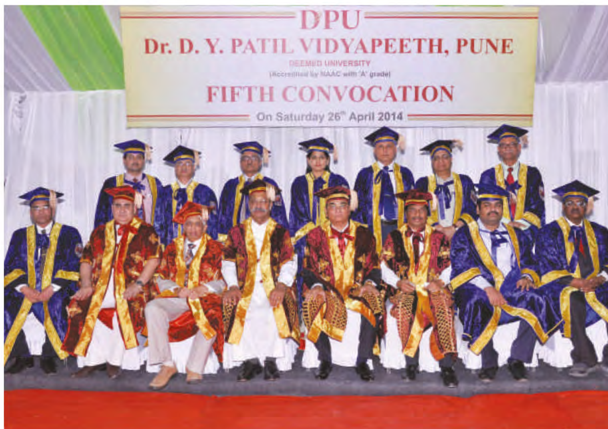
Members of Board of Management