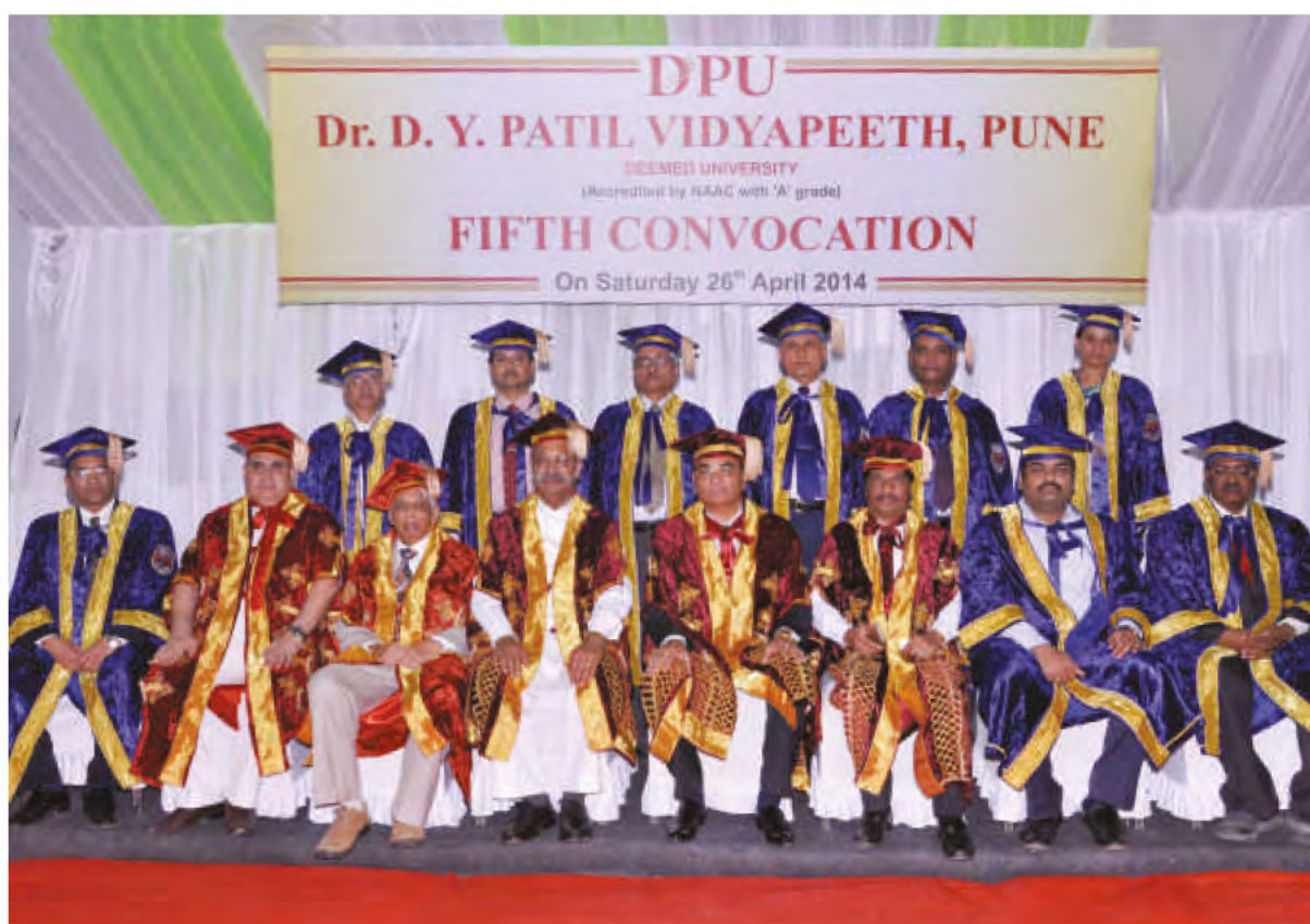
Deans of faculties