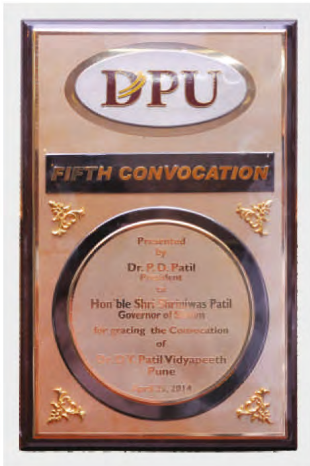
The memento presented to honourable Shri. Shriniwas Patil , Governor of Sikkim on the occasion.