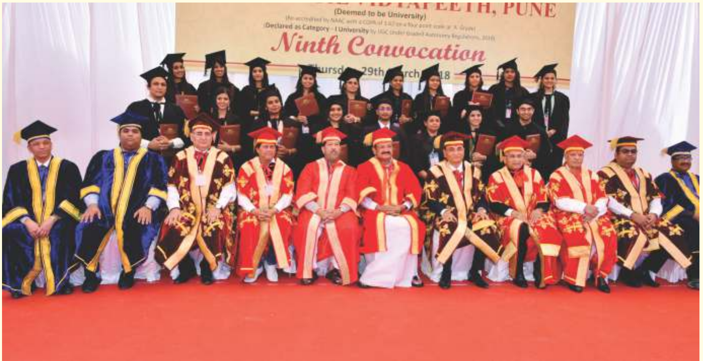
Dignitaries with Gold Medalist