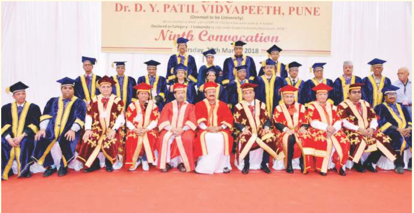
Members of Board of Management and Deans of Faculties