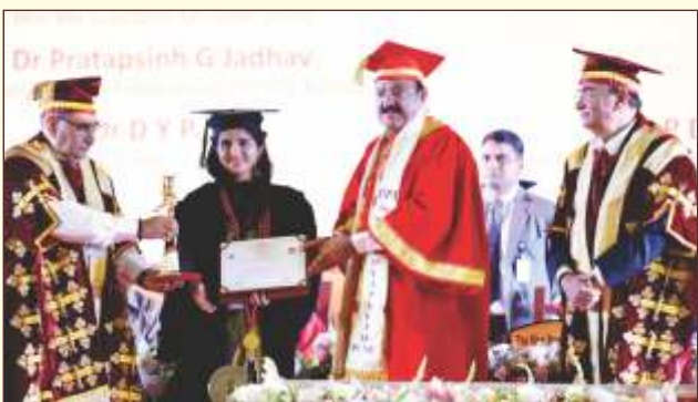
Sakarkar Praneeta Trilok Post-Graduate Medical Diplomas Examination